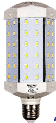
hansen SIRIUS 24W