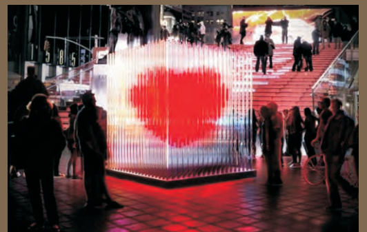
LED Pipe as light-art