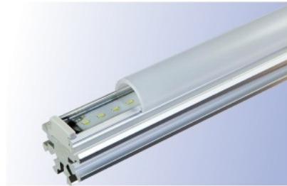
Parallel series connection of LEDs

The star-shaped cross-section offers various mounting possibilities while the entire profile serves as an efficient heat sink for the powerful LEDs.