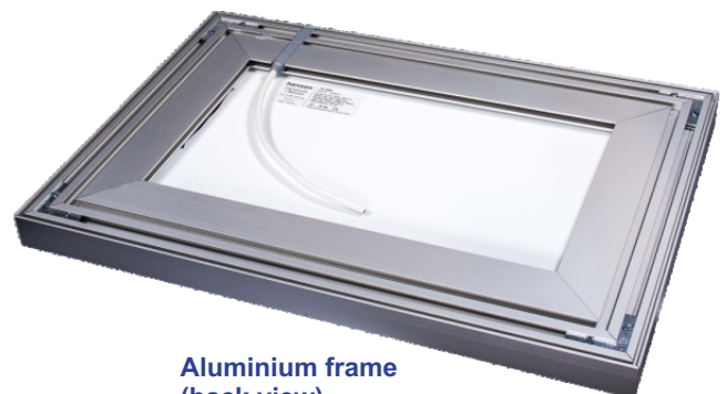
Aluminium frame (back view)

Please contact us for exact sizing information, prices and technical details.